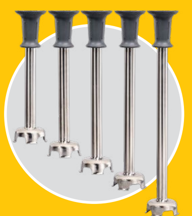
Interchangeable Shaft 12"/305mm, 14"/355mm, 16"/406mm, 18"/457mm, and 21"/533mm (sold separately)